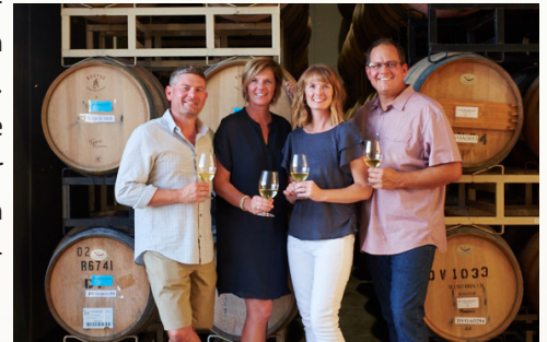
from left to right...

Our 2022 Boomtown red wines hail from The Cliffs Vineyard, perched right along the mighty Columbia River in the Southeast corner of the Horse Heaven Hills AVA. Beautiful fruit and balance are the hallmarks of these wines, and with the addition of roughly 10-15% of our Dusted Valley estate fruit, the result yields wines with polish, concentration and varietal typicity that over deliver time and again.